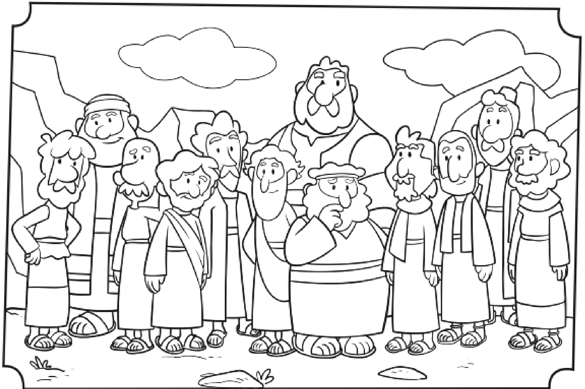
Meet the Disciples